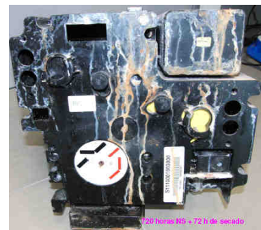
Fig. Driving mechanism after 720 hours salt-fog test

Once all these tests have been passed and completed a time cycle of 720 h in a salinity chamber test we can assure that these devices are classified under a C4-High (applicable C5-Medium, marine) category and are suitable for offshore applications under very high corrosive conditions.