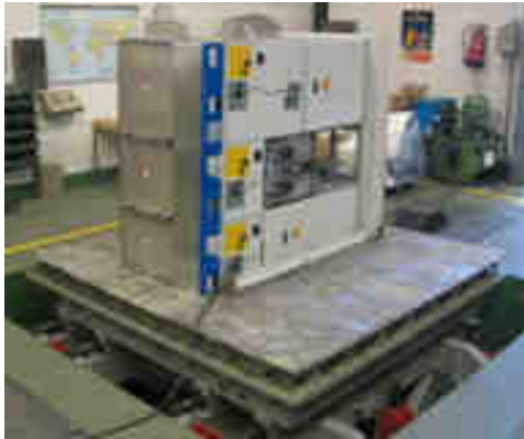
Fig. MV switchgear on vibrations testing platform.

EN 22247 “Packaging – Complete, Filled transport packages – Vibration test at Fixed Low Frequency” , applying a 4Hz frequency value and an acceleration of 0,875 sc with an maximum amplitude of 27,2 mm.