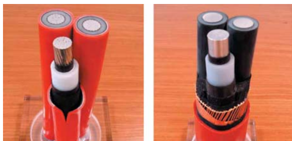
Photo 5 'HPTE insulated cable types, on the left type of 3x1x185 mm 2 – ARP1H5EX 12/20 kV, on the right type PMeKrvaslqwd 6/10kV 3x240Alrm as70.

For Prysmian, but also for utilities who uses the HPTE insulated cables, the reduction of the carbon footprint during cable production is an appealing benefit, more than 50% [5] [7] is reachable. Also the savings on water, energy (more than 75% [7]) during cable production, and the feature of easy re-usability, makes the HPTE a 'green' cable compared to the XLPE insulated cable.