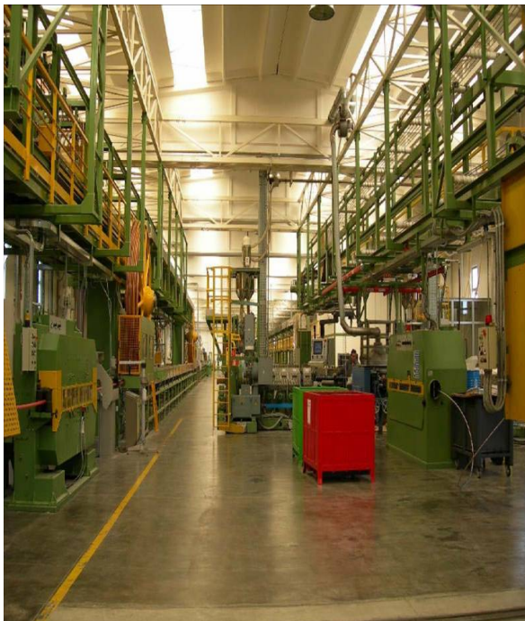
Photo 1 'HPTE insulated' 7-step single production line at Pignataro, Italy'

Hereafter, a 9 km core 240 mm 2 Solid Al, 6/10 kV full thickness for Nuon/Alliander (Dutch utility) was produced at Pignataro and further finished (lay-up, screening, jacketing) into a 3 core cable at the Prysmian factory in Delft, the Netherlands.