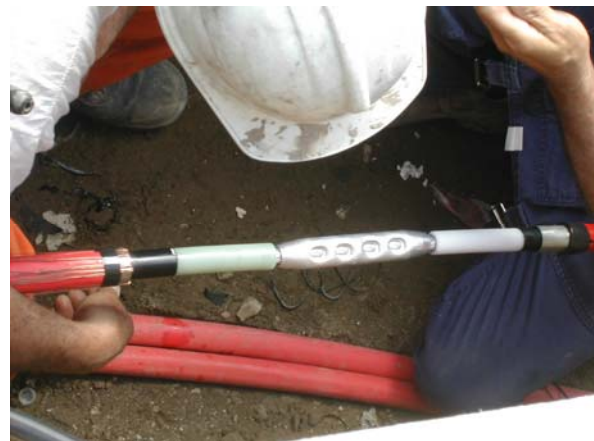
Photo 4 'single core 12/20kV HPTE insulated cable (right) joined to XLPE insulated cable'

In 2009, Alliander showed interest in a second pilot project with HPTE insulated cables, now for a HPTE insulated 6/10kV single core 630mm 2 solid aluminium. However, this core size could not be produced on the present HPTE production line at Pignataro. Two actions were unfolded: introducing HPTE production capability at the Prysmian plant in Delft, making the Delft production lines capable of producing MV insulated HPTE insulated cores in the voltage class ranging from 6/10kV up to 20.5/42kV and conductor sizes 35mm 2 – 1200mm 2 solid Al, and the installation of a second pilot project, again based on the 6/10kV 3core 240mm 2 solid Al cable, which was successfully finished in 2010.