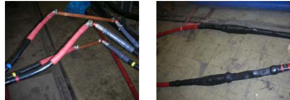
Photo 3 'HPTE insulated cable type PMeKrvalqwd 6/10kV 3x240Alrm during compatibility type tests with terminations (left) and joints (right)'

After this successful type test, 3 km of 3 core cable was installed (2007) in the Alliander MV grid as a pilot project. The HPTE insulated cable was integrated with standard joints in the existing network with XLPE insulated cables and is three year after installation and commissioning still in service today without any remarks.