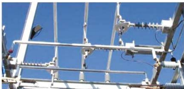
Fig. 2 - Example optical CT showing freedom to mount in different orientations, such as horizontally