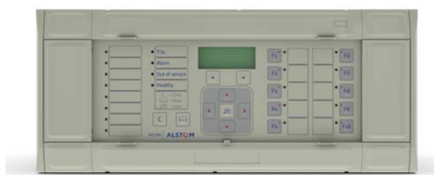
Fig. 4 - Example process bus protection relay

The authors' company's IEDs extend their supervision facilities to include comprehensive addressing and plausibility checking of the incoming sampled values from the process bus. This addresses the fact that the traditional task of current and voltage sampling is now external to the device, and is connected via Ethernet. This ensures maximum security, dependability and speed of the protection scheme.