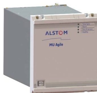
Fig. 3 - Example merging unit

Digital controllers (SCU - switch control units) are the fast, real-time interface to switchgear, mounted close to the plant which they command. They replace hardwiring of inputs/outputs by an Ethernet interface to the yard.