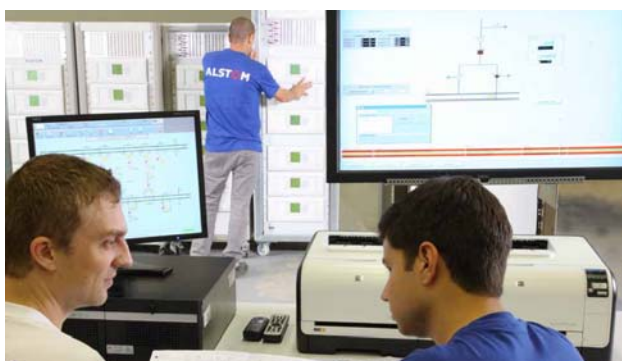
Fig. 5 - Digital Control Systems: the marriage of state-of-the-art software and intelligent electronic devices

Wide area control units (WACU) offer the possibility to exchange IEC 61850 GOOSE data between voltage levels within a substation and also between neighbouring substations.