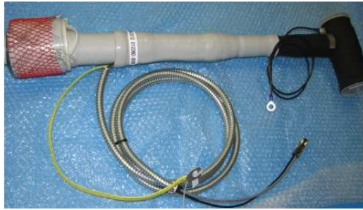
Figure 3: the plug-in sensed termination from 3M

Furthermore the modular system design on which 3M has built their sensed termination enables application extension to plug-in interfaces, while maintaining the same "plug & play" connection and sensor module characteristics and performances (see Figure 3).