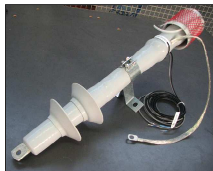
Figure 2: the sensored termination from 3M

Building on over 40 years experience in the design and manufacture of cable accessories for MV networks, and on their broad technology platforms, 3M has developed an innovative solution that integrates very high accuracy sensors with a MV cable termination (see Figure 2).