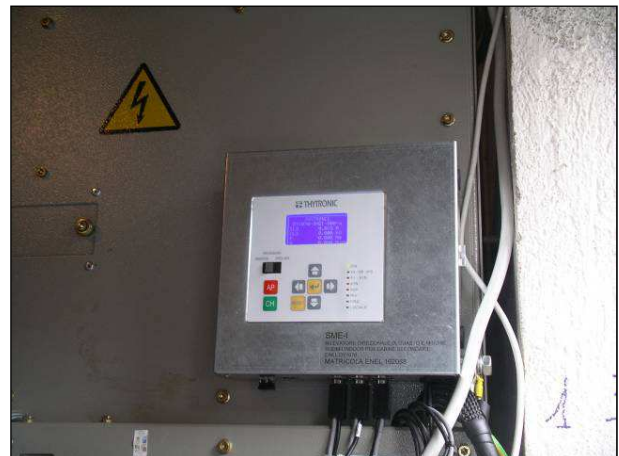
Figure 1: the Enel Distribuzione "RGDM" device

The Enel Distribuzione need was to have suitable sensors to measure line current and voltage, that were able to interface with the Enel "RGDM" Smart Grids devices (see Figure 1).