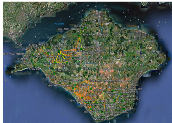
Figure 1. SHF radio design system mesh

Figure 1 illustrates an example of the SHF radio link locations, mesh topology model achieved.