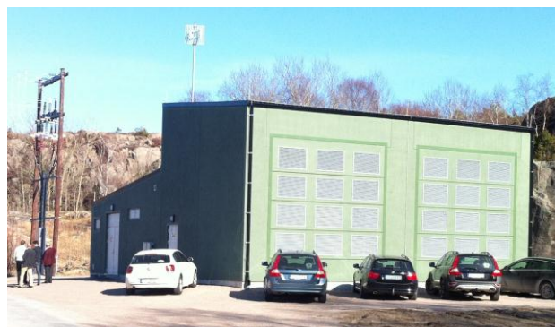
Figure 1: New substation delivered by ABB

Substations with new type of switchgears have been developed, tested and delivered by two manufacturers. The costs for 40 kV switchgear and additional equipment were reduced with 30 % compared to the old design.