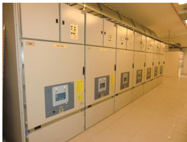
Figure 3: Newly installed switchgear

After the type tests were finalized, ABB delivered switchgears from their factory in China. Schneider decided to move their manufacturing to Turkey. Three switchgears of this new type are now installed in new substations in west and mid Sweden. The installation at site was mainly without problems except that the distance for the cable connection was too small as cables were rated 52 kV and the general design of switchgear is for 40.5 kV. The distance for the cable connections was increased as the bottom of switchgear was lowered. The switchgears are successfully in operation.