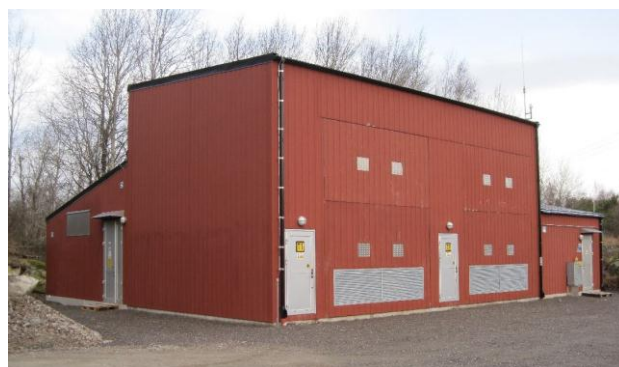
Figure 4: New substation delivered by Schneider

New switchgears have been installed in three substations and are successfully operating. In spite of costs for additional arrangements at incoming lines, such as introduction of spark gaps and longitudinal earth conductors, the total cost is reduced with 30% for switchgear plus additional costs. An advantage is the use of vacuum circuit breakers instead of gas-insulated. Vattenfall has a general policy to avoid SF 6 -gas when possible. As up to now the experience is positive general use of the new switchgear type is recommended.