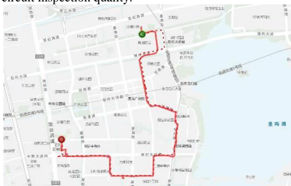
Fig.2 The supervision of cable circuit patrol

The developed system could guide maintenance engineers to inspect power cables in a more precise way with the aid of the system navigation. Take Gangjin Circuit for instance, the red full line in Fig.2 shows the automatically planned paths in the system which could guide the inspectors for circuit patrol, during which GPS is for real-time positioning so as to playback the inspection tracks. In Fig.2, the red dotted line refers to the actual patrol path of the inspectors and the system could compare the planned and actually walked paths automatically, thus realizing intelligent control over the circuit inspection quality.