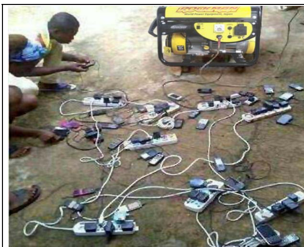
Figure 1. An ad hoc nano-grid use to charge cell phones from an electrical generator.

Electrification is associated with an increased standard of living and is needed for charging phone, lighting for handwork and studying in the evening, electric sewing machines, refrigeration, etc.