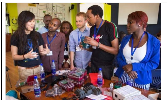
Figure 4. Sambaza Watts being demonstrated at iHub in Nairobi Kenya[13].

Schneider-Electric is looking for additional collaborators that can perform additional field trials with Sambaza Watts. While initial steps were taken to work with iHub in Nairobi, we are seeking to interact with more local communities where Sambaza Watts can be customized to local needs and deployed to communities. Customization can include varying tariffs