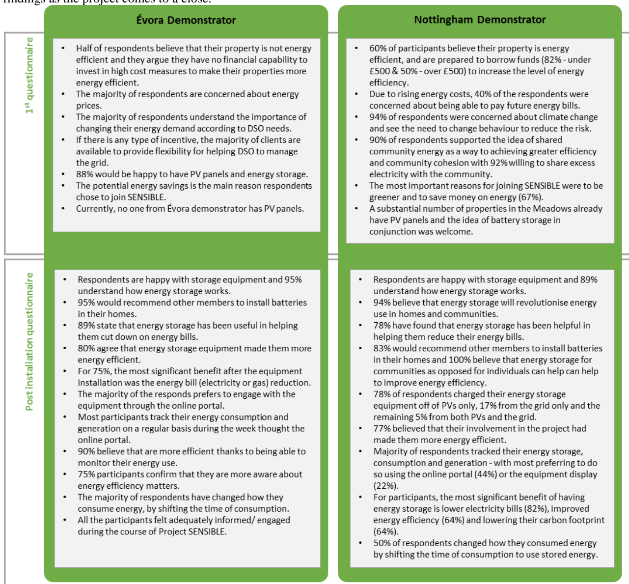
Figure 1- Main questionnaire results from Évora and Nottingham

Figure 1 summarises the most important results of both questionnaires.